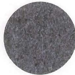
Navy Legacy 4651-60