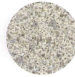
Gray Glace 4142-60