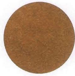
Burnished Ember 4798-60