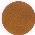
Wild Cherry 7054-60