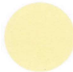
Natural Almond D30-60