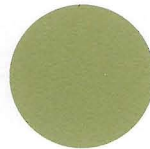
Tuscan Olive D481-60