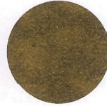
Windswept Bronze 4794-60