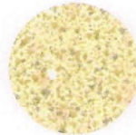
Neutral Glace 4143-60