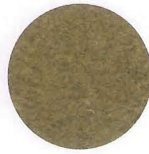
Evening Tigris 4674-60