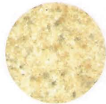
Mystique Dawn 4762-60