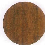
Windsor Mahogany 7039-60