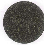
Graphite Nebula 4623-60