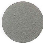
Dove Gray D92-60