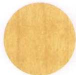
Fusion Maple 7909-60