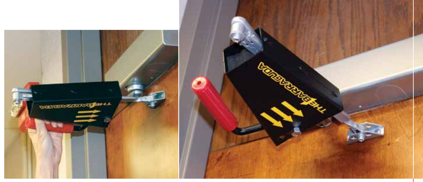
Due to the wide variety and inconsistency of door closers and their fasteners, it is not recommended to use the DCS as a standalone solution.