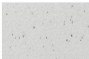
219 Frost Granite