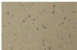
217 Canyon Granite